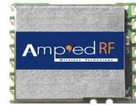
10.4mm x 13.5mm